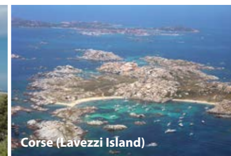
Corse (Lavezzi Island)