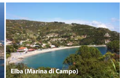
Elba (Marina di Campo)