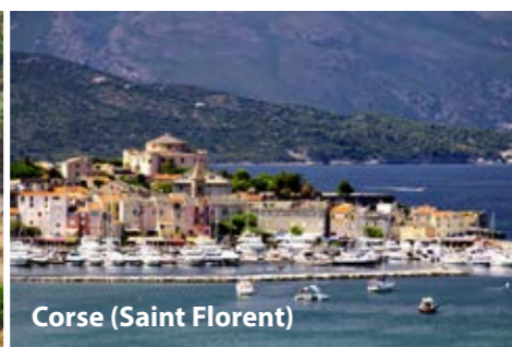
Corse (Saint Florent)