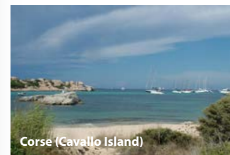
Corse (Cavallo Island)

Today's destination is Cavallo island. It extends for one kilometre in the trait of the sea between Corse and Sardinia, a stretch between the Strait of Bonifacio and the Archipelago La Maddalena. It is the most Caribbean island of Mediterranean sea, the pearl of the Archipelago of Lavezzi. At first sight it seems to emerge from the sea to create a magical dock for sailing lovers. Pay serious attention: this trait of sea is very difficult to navigate, because of the currents that push boats towards the reefs.