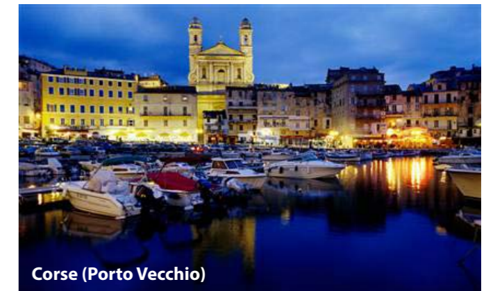
Corse (Porto Vecchio)

Weigh anchor early in the morning to reach Elba and Marina di Campo. The idyllic town will surprise you: food is very good and a walk in the inner city is compulsory. The beach is comfortable, nearby the harbour and with a pinewood where you can stay to have some relax. If southern winds blow you should have a safe anchorage. The jetty is not sufficient and mooring could be difficult when Sirocco blows.