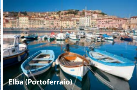
Elba (Porto Ferraio)