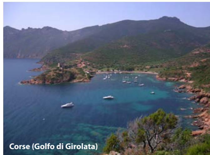
Corse (Golfo di Girolata)

Let's sail to Calvi! A little de-tour for a bath at Isola Rossa is not to be missed. The name comes from the ochre of the rock island used as natural harbour. Calvi is enclosed between sea and mountain, extremely attractive thanks to the city walls, that arrive up to the crystal water, the immense bay and the beautiful beach that seems limitless.