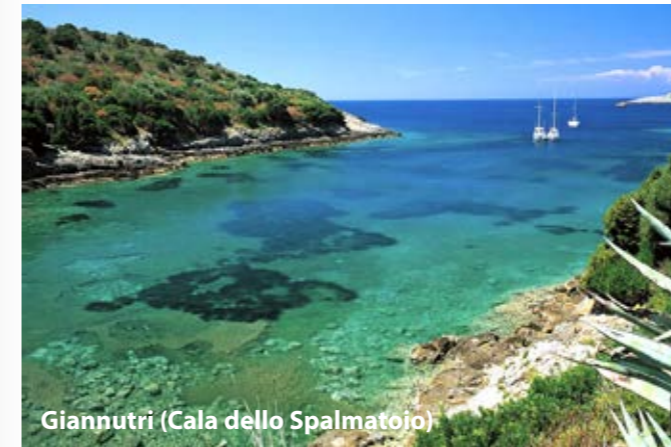
Giannutri (Cala dello Spalmatoio)

Lift the sails towards Giglio! Its coast is discontinuous, with rocks spaced out only by inlets and bays. Giglio Porto is the only harbour of the island. Small and picturesque, it is also a residential area with characteristic coloured and narrow houses, that create alleys and small streets.