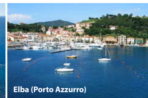
Elba (Porto Azzurro)