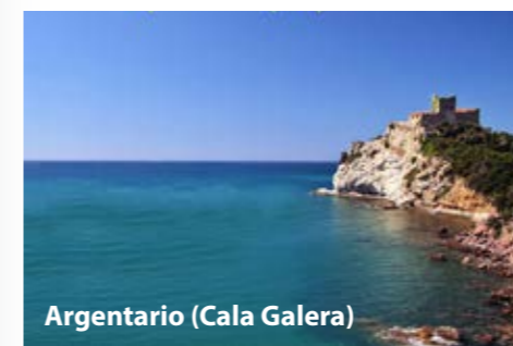
Argentario (Cala Galera)

Sail to Porto Ercole and dock in Cala Galera. From the harbour you can walk along the promenade, which will surprise you with its cafès, restaurants, and terraces with sea view. A tour among alleys, staircases and little squares of the burg that raise on the seaboard is unavoidable. Not to be missed: Forte Filippo, La Rocca and Forte Stella, the three perfectly preserved fortifications where to admire wonderful panoramas.