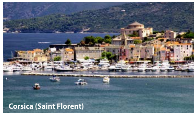
Corsica (Saint Florent)

Route to Bastia. Take a refreshing swim in the beautiful bay of Centuri, where the crystal sea and the colours of Corsica will surprise you. The town is an outright architectural jewel, enashed among the green of mountains. Not to be missed: Bastia and its history are waiting for you!