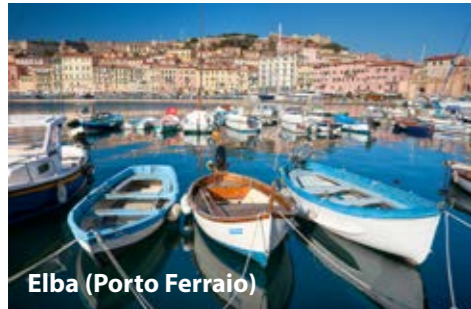
Elba (Porto Ferraio)